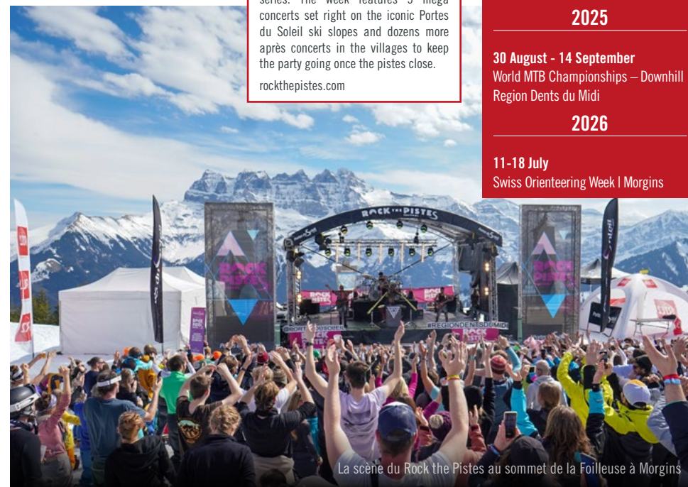
La scène du Rock the Pistes au sommet de la Foilleuse à Morgins