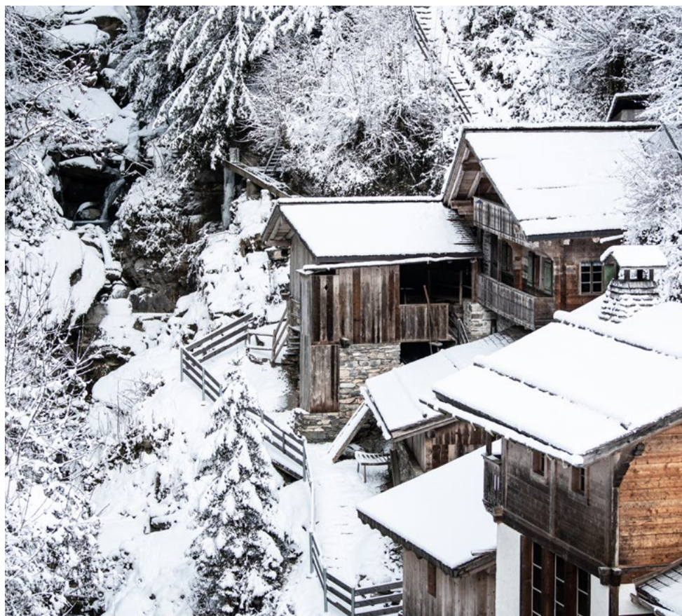
Les Moulins de la Tine