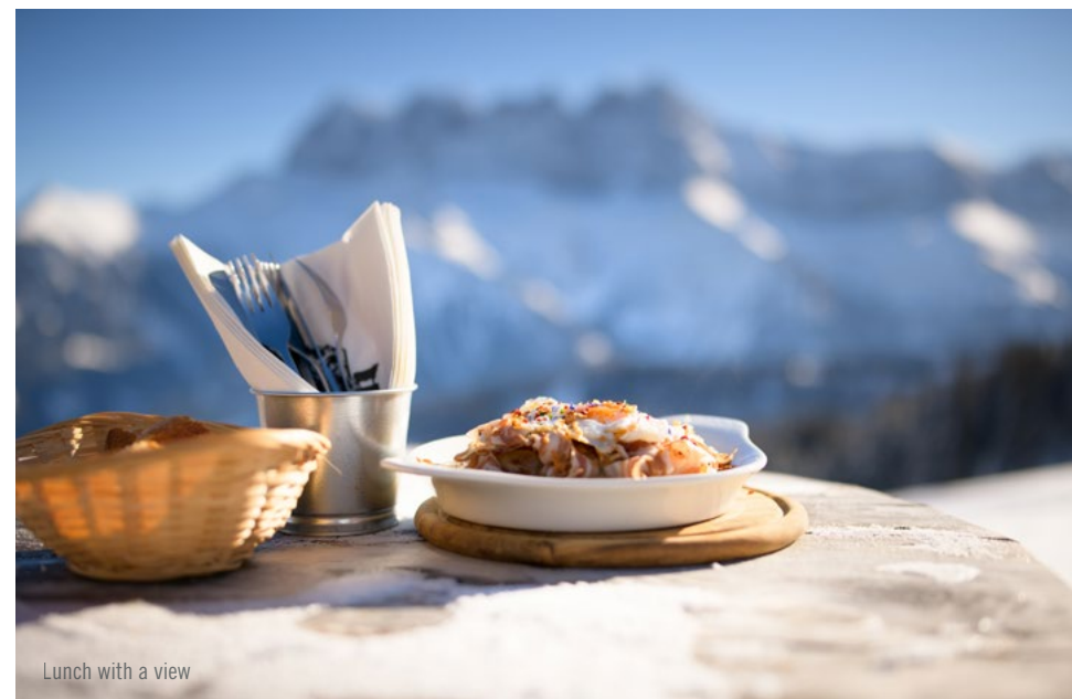
Lunch with a view